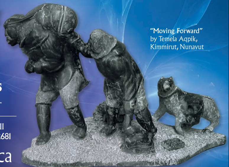
"Moving Forward" by Temela Aqpiq, Kimmirut, Nunavut